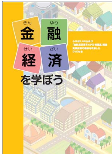
Cover of “Learn about Finance and Economics” teaching plan booklet with accompanying DVD