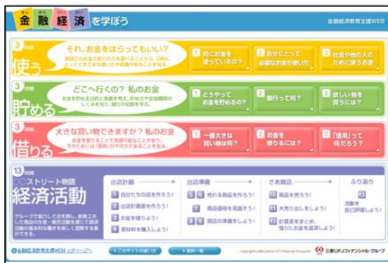
Top page of lesson contents section of “Learn about Finance and Economics” website