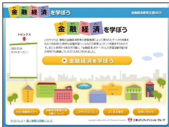
Top page of “Learn about Finance and Economics” website