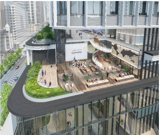
4th floor: Lounge/co-creation space

Basement floors: Shops and restaurants, parking, etc.