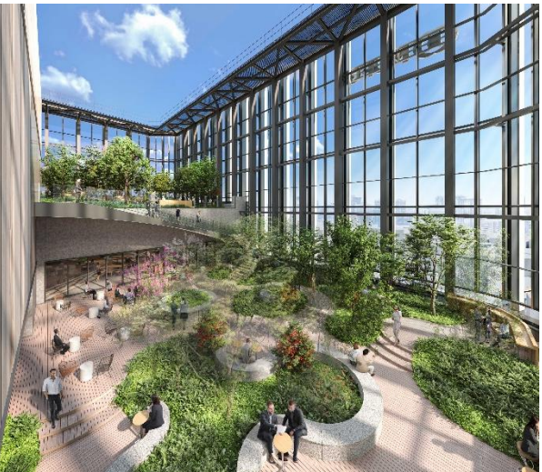
27th and 28th floors: Rooftop terrace and lounge